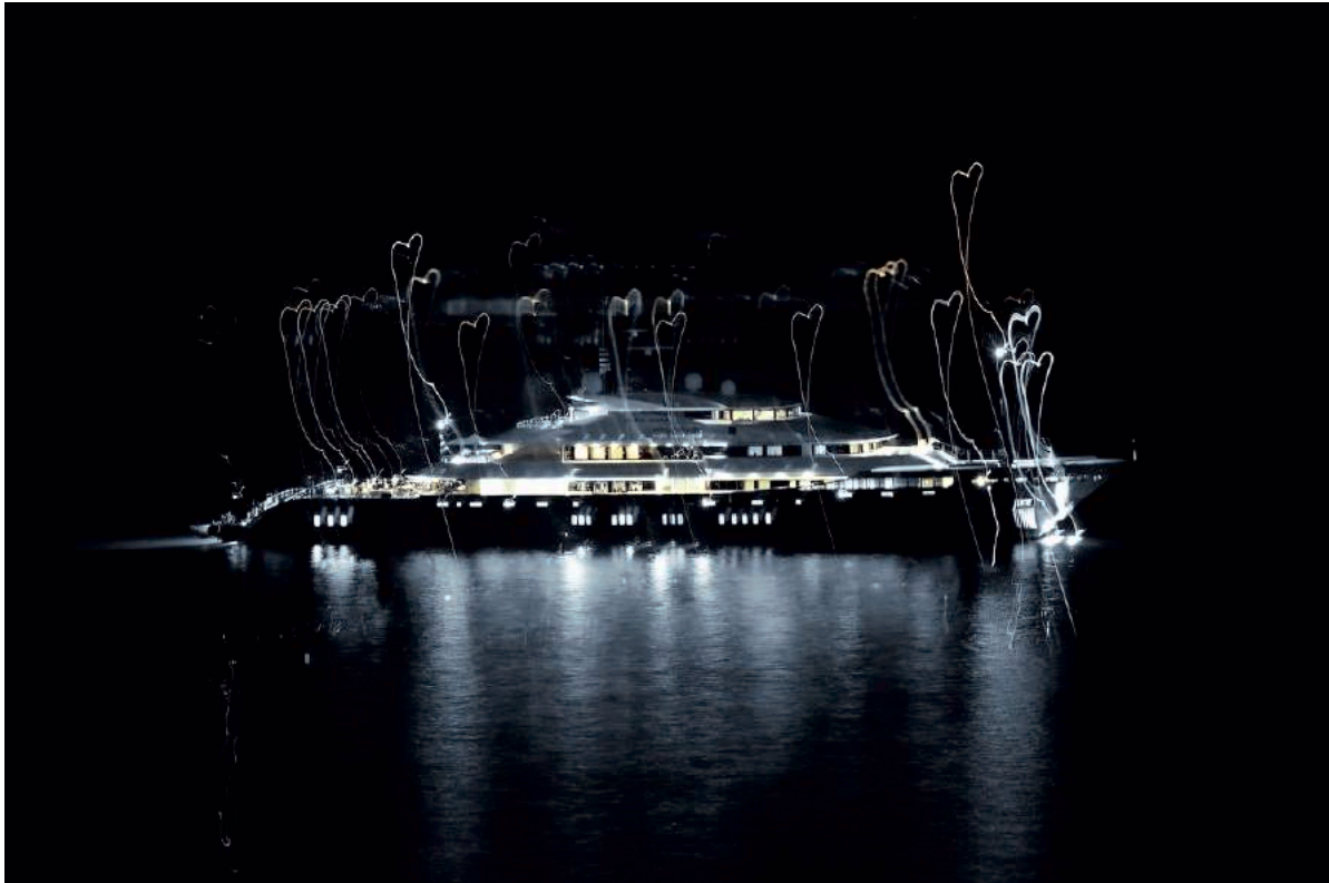
"The hearts of Alfa Nero", M/Y Alfa Nero, Oceanco, Nuvolari & Lenard. Monaco 2017

Using intentional camera and lens movement technics to give the abstract mood to each art-work. The yachts' lightning and exterior lines set the conceptual ideas for the photos. The rest is just a mental and physical sensual dance between the authors and the camera to uncover the real spirit of each yacht.