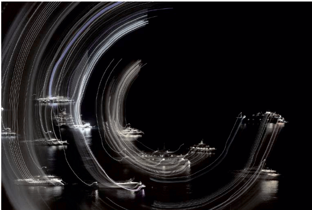
MYSTERY of MYS ( Monaco Yacht Show), Monaco 2017

RSVP your access to the lounge and exhibition: contact@fineseas.com